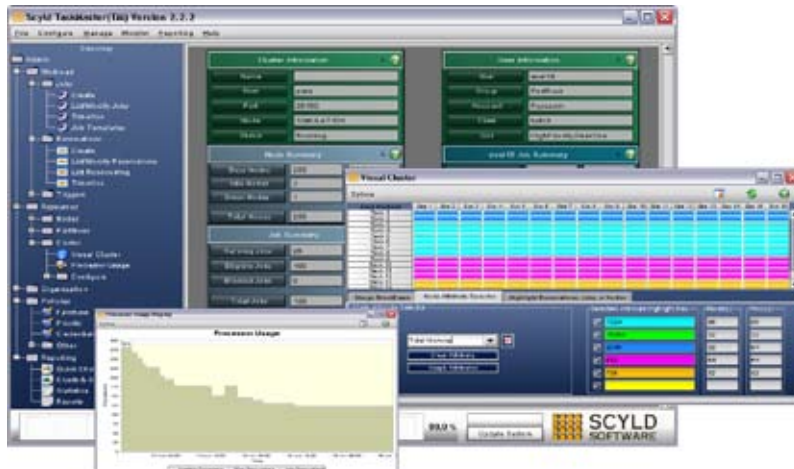
Figure 4. Scyld TaskMaster: Powerful Policy-Based Workload Management- Comprehensive Cluster Visibility

The powerful monitoring and reporting mechanisms built into Scyld TaskMaster, capabilities that are an additional cost in competing products, enable instant visualization of live and historical utilization, resource allocation, and backlog data and the creation of numerous reports on this information that are customizable for your needs, all with a few mouse clicks instead of the hours or days required with command line alternatives with text reporting only. Scyld TaskMaster vastly increases both user and administrator productivity and delivers an exceptionally high return on investment every day it is utilized.